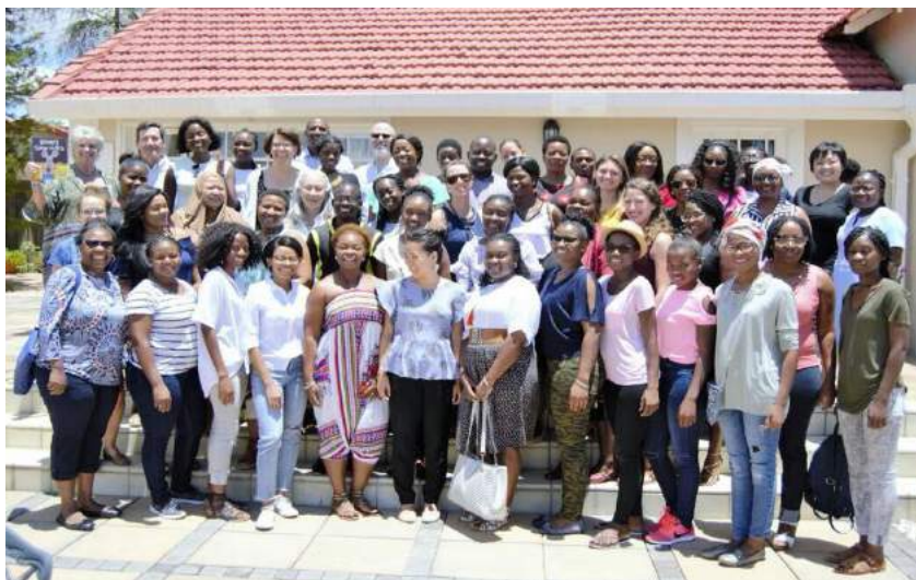
Training of new volunteers for read Namibia at the American Embassy residence

Many NIWA members were trained as volunteers to read out to children and empower parents with the reading skills.