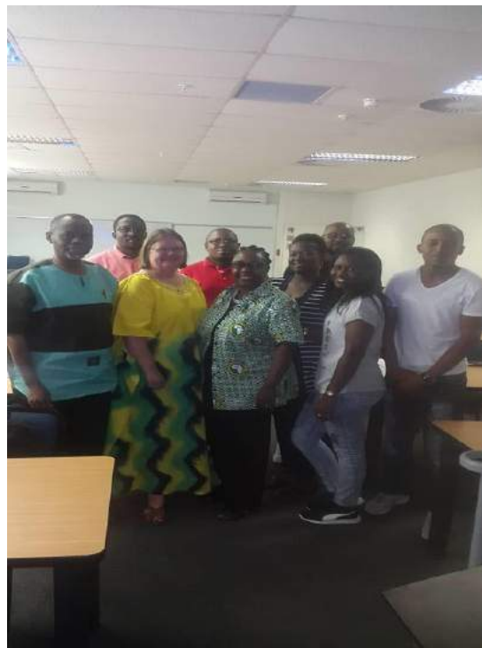
Members at the workshop, 09 th December 2016