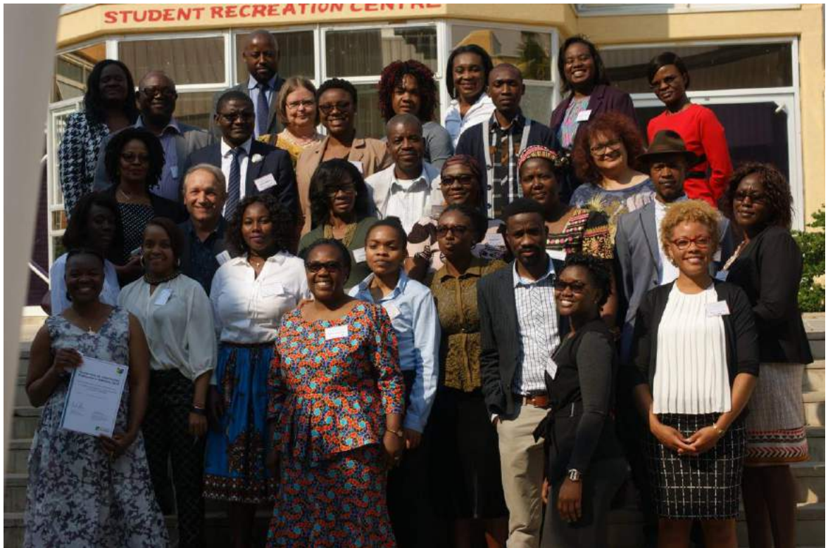
Presenters captured during the conference at UNAM PK1Hall

such an important conference where librarians and information officer were able to share experiences, tackle challenges and also come up with resolutions on how we can move the profession forward.