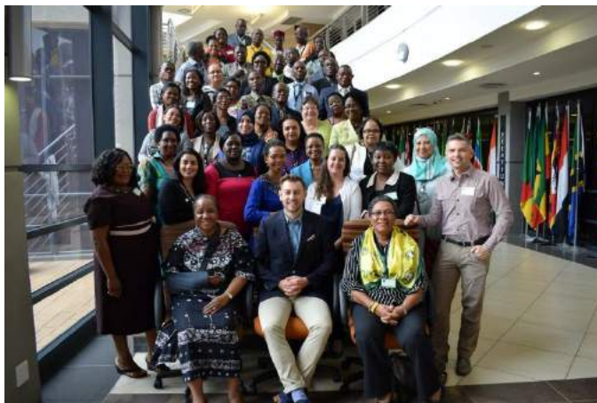
Namibian representatives in attendance with other participants at the IFLA International Advocacy Regional Workshop in Pretoria, South Africa.