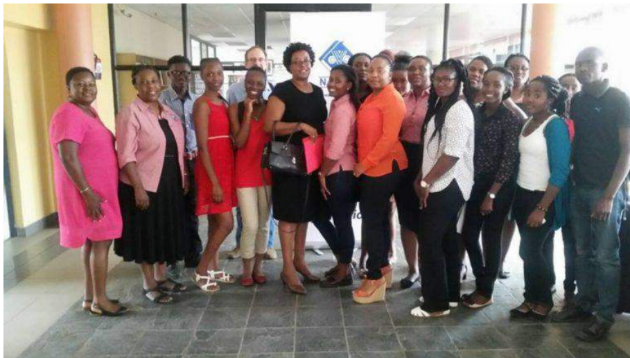
The EXCOM pictured with the members at one of the meetings

After the hand-over meeting on the 16 th November 2015, NIWA had 16 meetings inclusive of the EXCOM meetings, general meetings and Annual General Meetings (AGM).