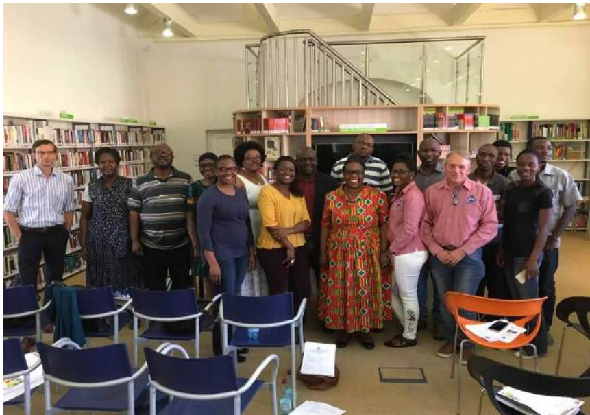
Members in attendance pictured with representatives from MICT at the Information bill discussion at Goethe Institute