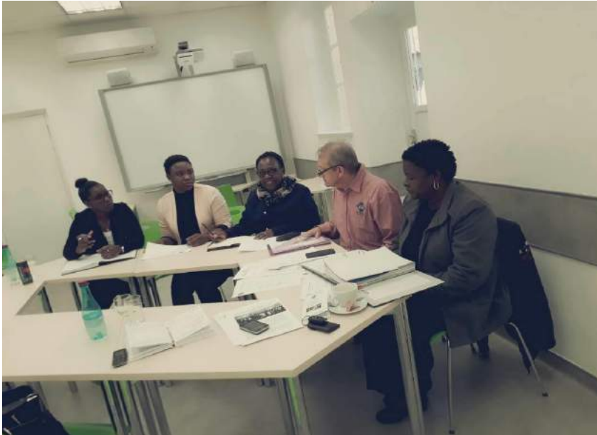
EXCOM discussing the information bill