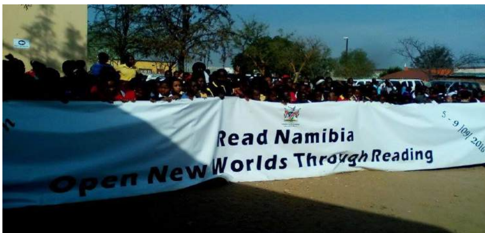
Learners from different schools in Khomas Region holding the Read Namibia banner