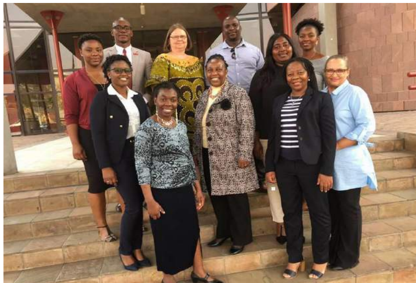
SCECSAL committee members at a meeting held at Bank of Namibia

The committee have opened a bank account for SCECSAL Namibia, the webpage is also underway and the team is trying its best to make sure that all the members in the committee attends SCECSAL 2018 in Uganda to learn best practices in preparation for SCECSAL 2020.