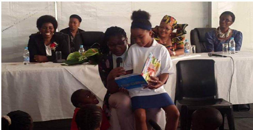
First lady of Namibia Madam Monica Geingos at the launch of Read Namibia in September 2016

by the First Lady of Namibia Madam Monica Geingos. This is a continuous project that will continue in supporting the Namibian child.